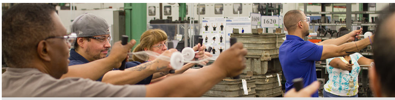
Employee's perform a morning warm-up using the WOW™ by BIKINETIX

Signaling the sympathetic nervous system. During physical activity, the sympathetic nervous system functions as a signaling mechanism that alerts different areas of the body to get ready for action, relying on neurotransmitters to deliver messages to the organs. When the body begins to warm up, the neurotransmitter norepinephrine is secreted into the blood, signaling the heart to increase cardiac output, heart rate and stroke volume, and dilation of blood vessels. Warming up also engages the sympathetic nervous system to signal and stimulate the nutrient production in the liver, increase enzymatic activity within the muscle, dilate the lungs, and slow down other organs in order to conserve energy for movement.